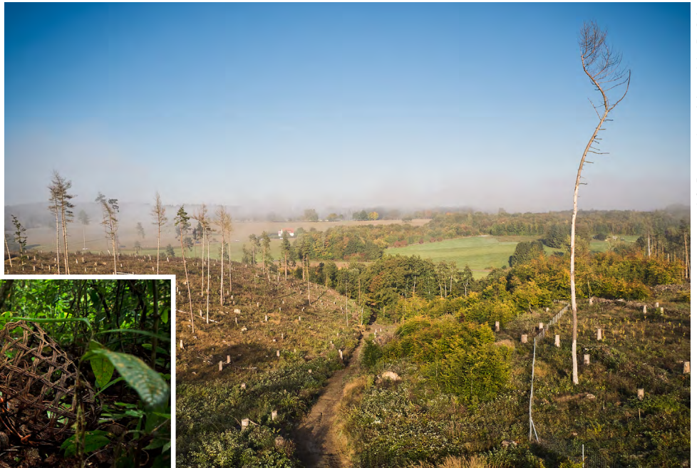
© left: Bosques Amazónicos, right: Re-Spire